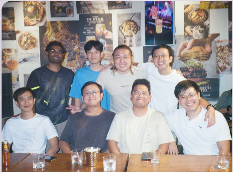
▲ Post exam celebration