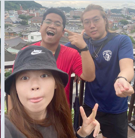
▲ Having fun at Everland during our NTU Discoverer Program in Korea