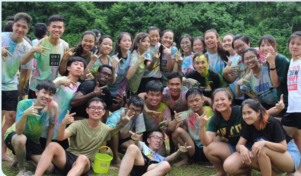
▲SuPreMeS MAMPOS, 2019