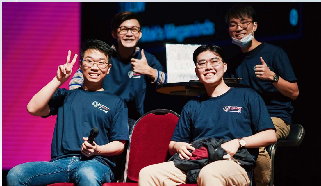
▲ COS Challenge