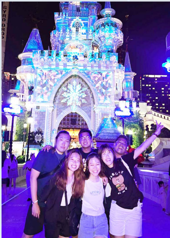
▲ Trip to Jeonju during our NTU Discoverer Program