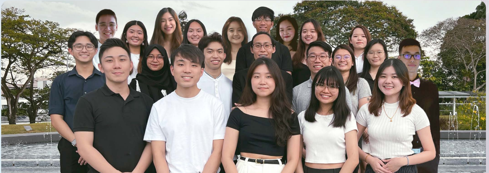
▲SPMS Club 17th Main Committee