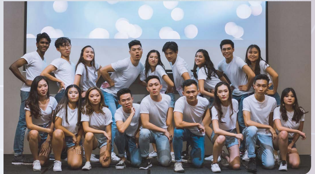
▲SPMS Pageant, 2019