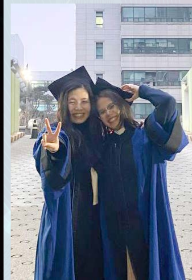
▲ Winter Exchange in Korea 2022