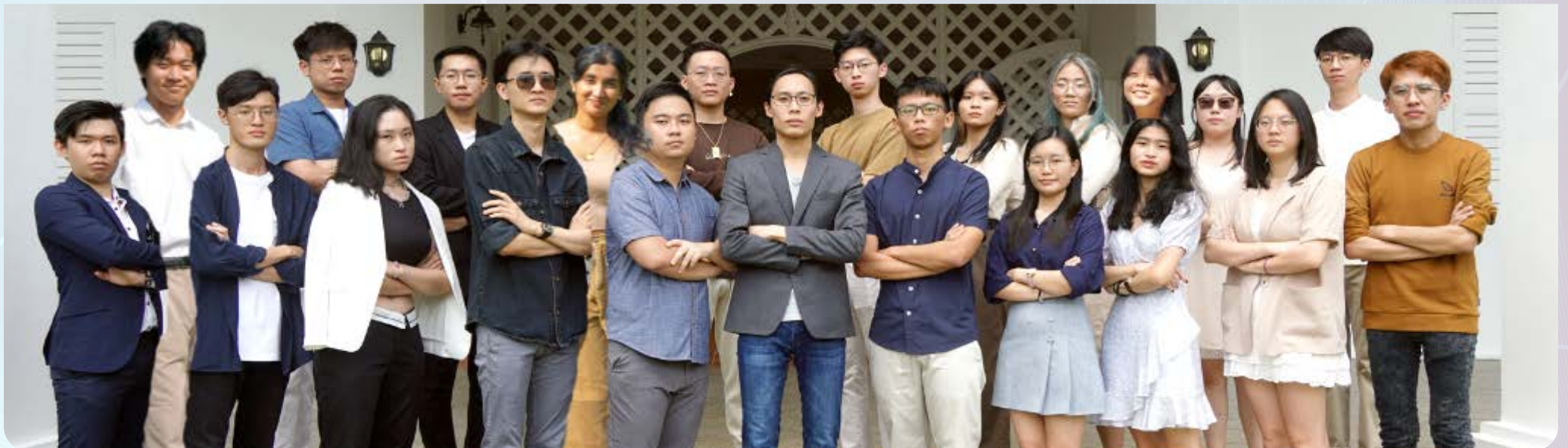
▼SPMS Club 18th Main Committee