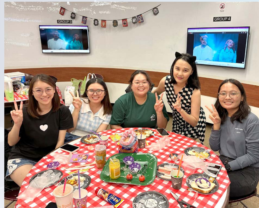
▲ Thai Cultural Activity