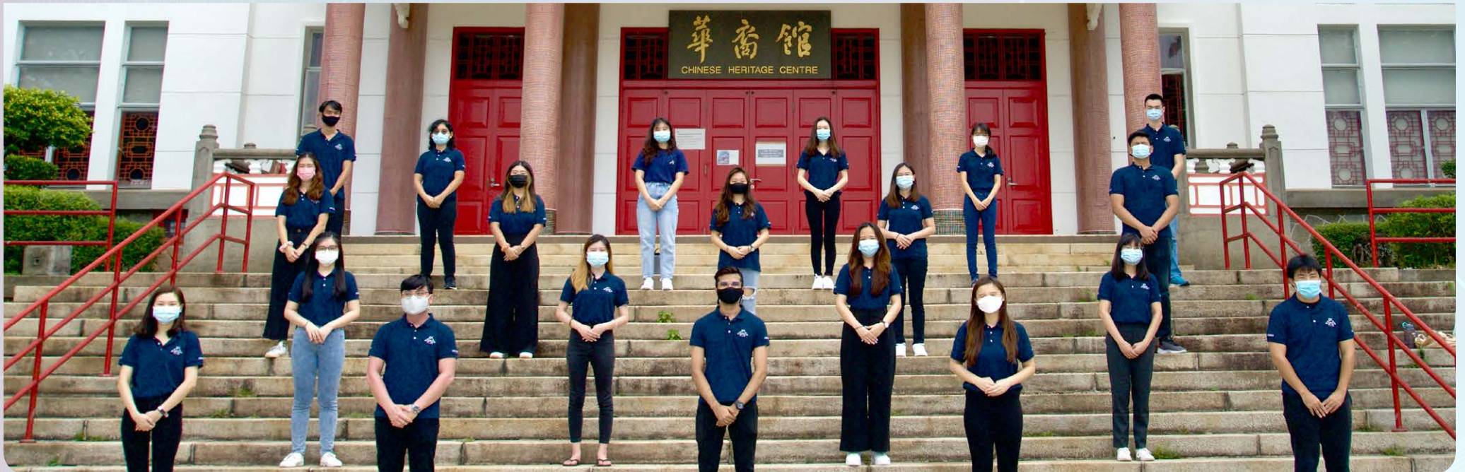
▼SPMS Club 16th Main Committee