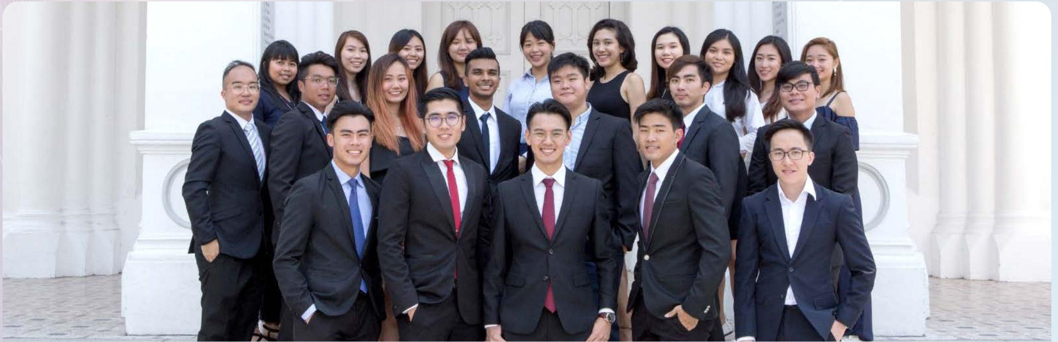
▲SPMS Club 15th Main Committee