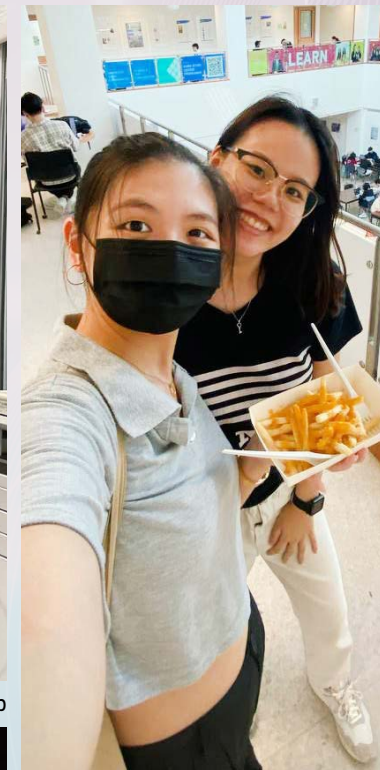
▲ Last day of Uni