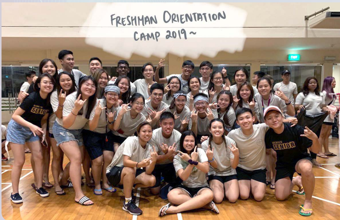
▲ One of my BEST camp experience!! Thanks USHA!