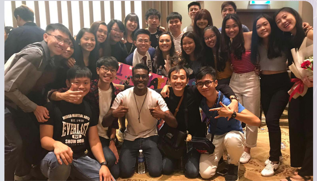
▲SPMS Pageant, 2019