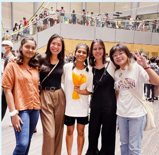
▲ Dance performance