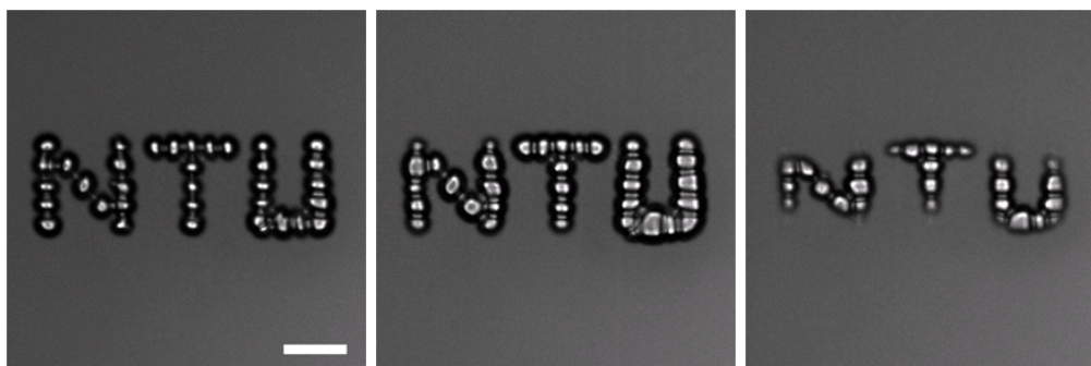
Fig. 3. NTU logo consisting of 34 cavitation bubbles 1.2 \mu\text{s} , 3 \mu\text{s} and 5 \mu\text{s} after the laser pulse ( E=56 \mu\text{J} ). The length of the scale bar is 100 \mu\text{m} .

utility of cavitation bubbles for mixing [27, 12] and pumping [13] fluids or to rupture plasma membranes of cells in microfluidic devices [14]. The use of the digital hologram allows these manipulations to be performed at different locations without scanning the microfluidic chip or the laser beam. This simplifies the experimental setup and allows fluid to be actuated by light and computers only; without any need for mechanical valves, wired connections, scanning mirrors, or position stages with micrometer resolution.